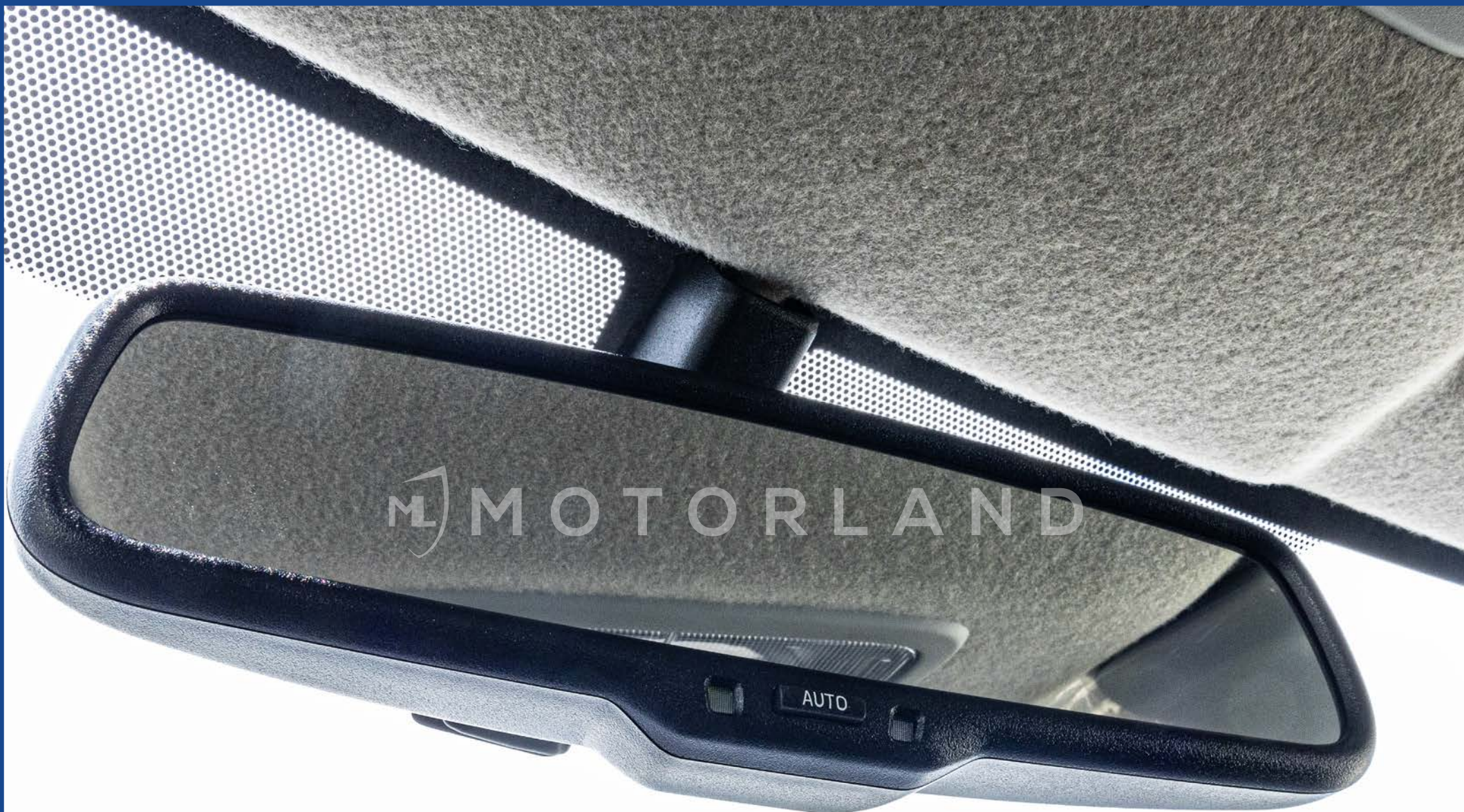
Rétroviseur interne électrique