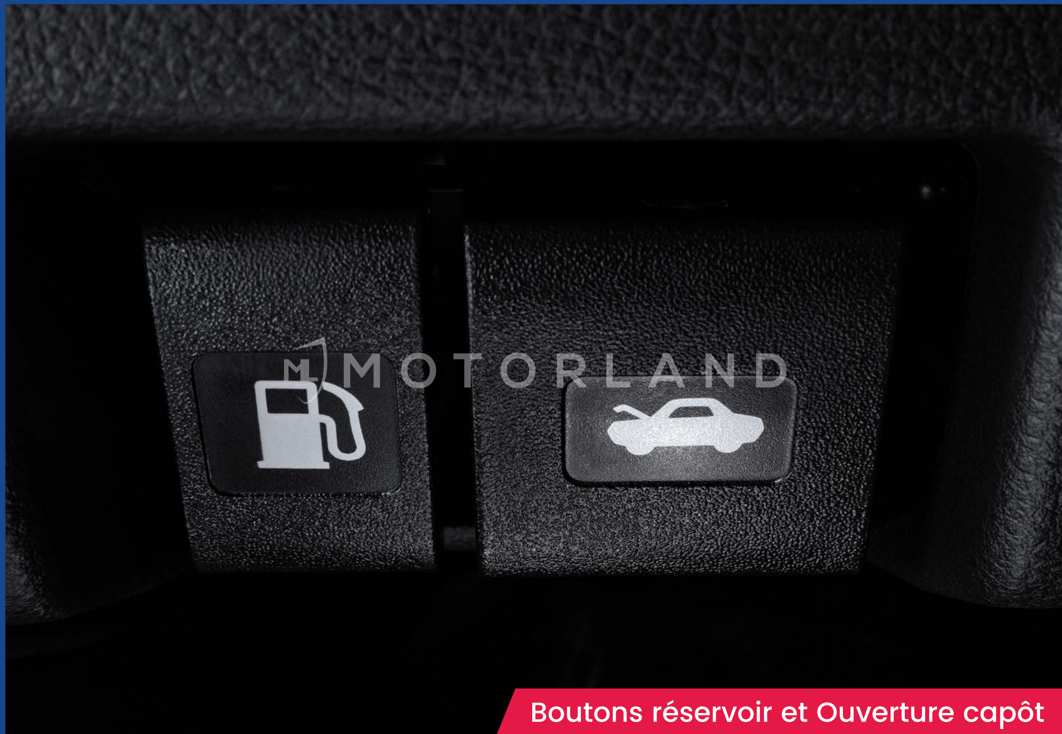
Boutons réservoir et Ouverture capôt