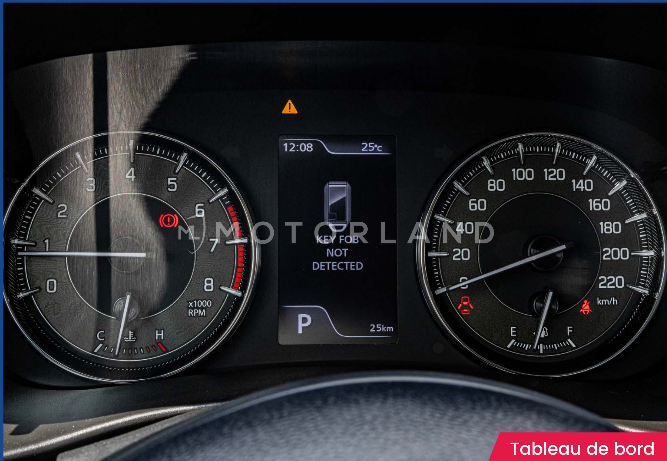
Tableau de bord