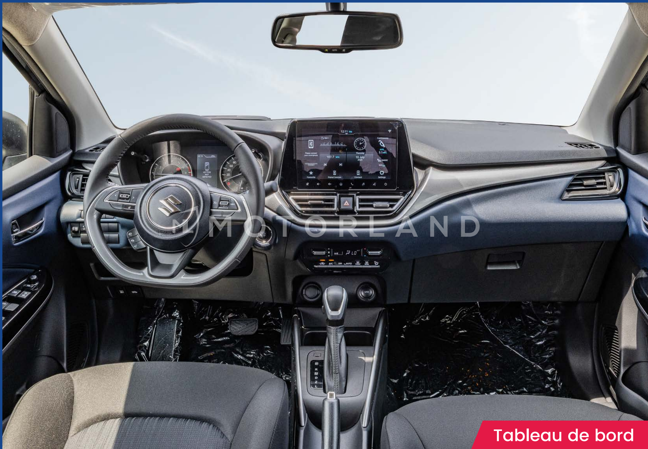
Tableau de bord