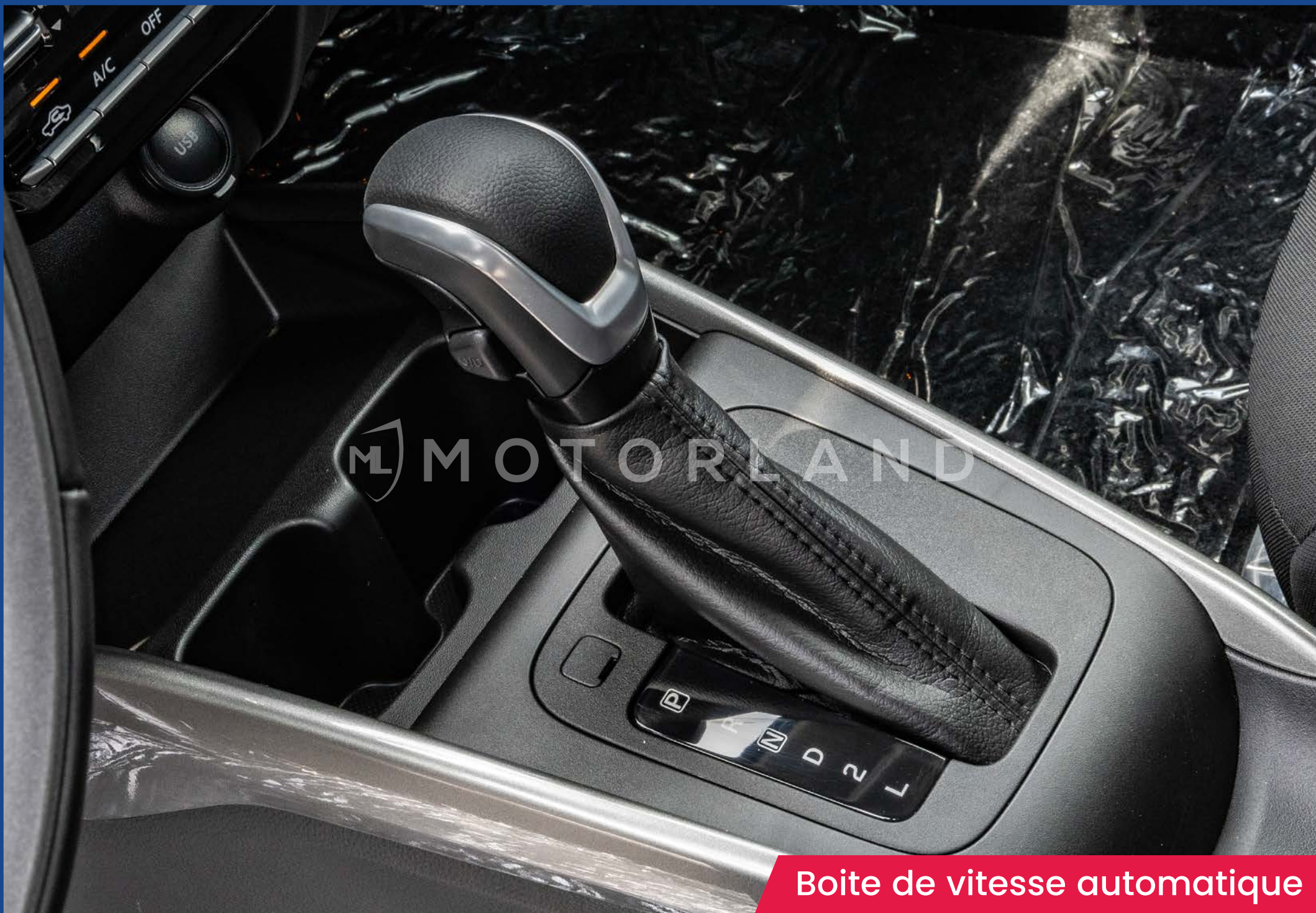
Boite de vitesse automatique