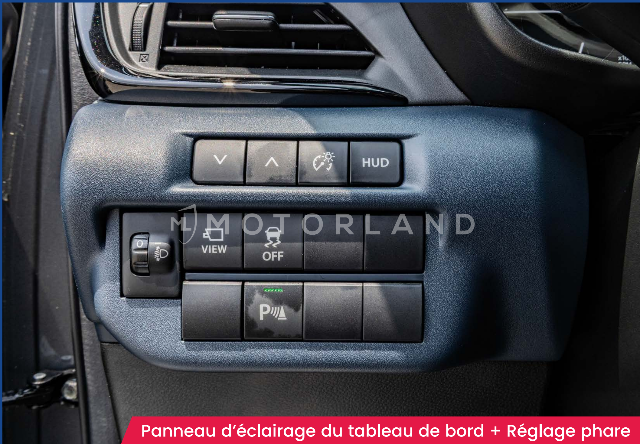
Panneau d'éclairage du tableau de bord + Réglage phare