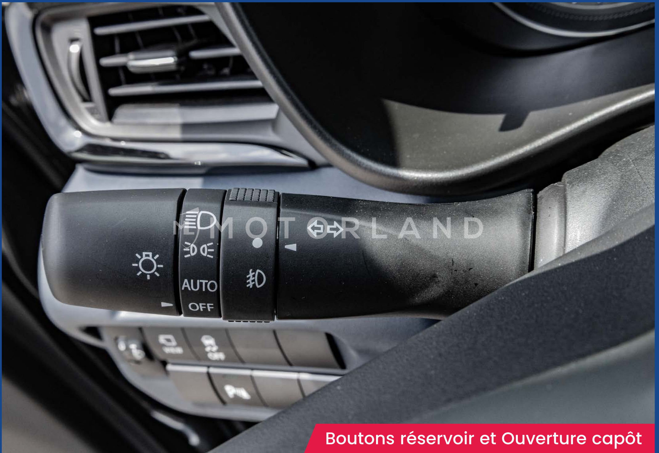
Boutons réservoir et Ouverture capôt