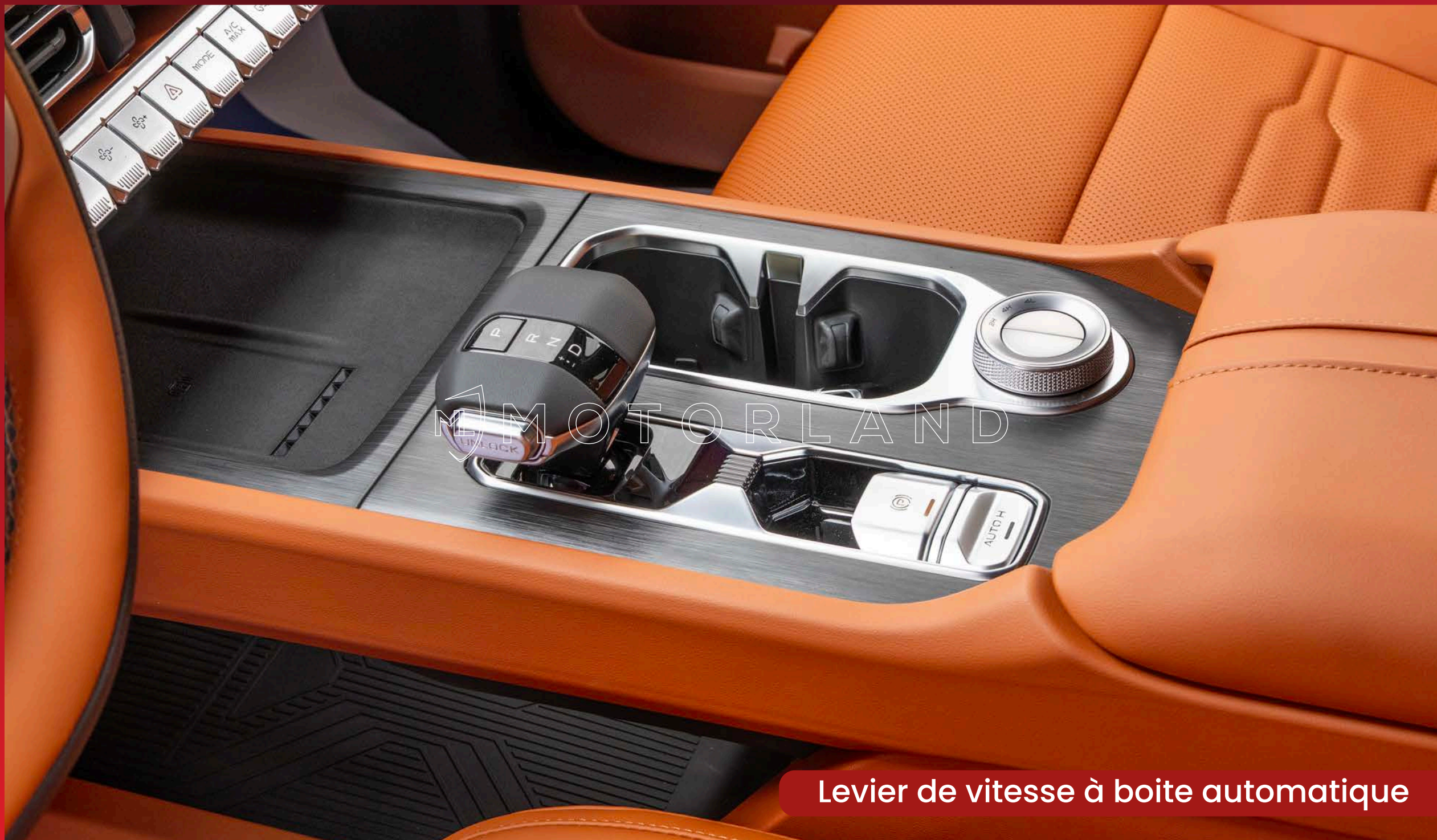
Levier de vitesse à boîte automatique