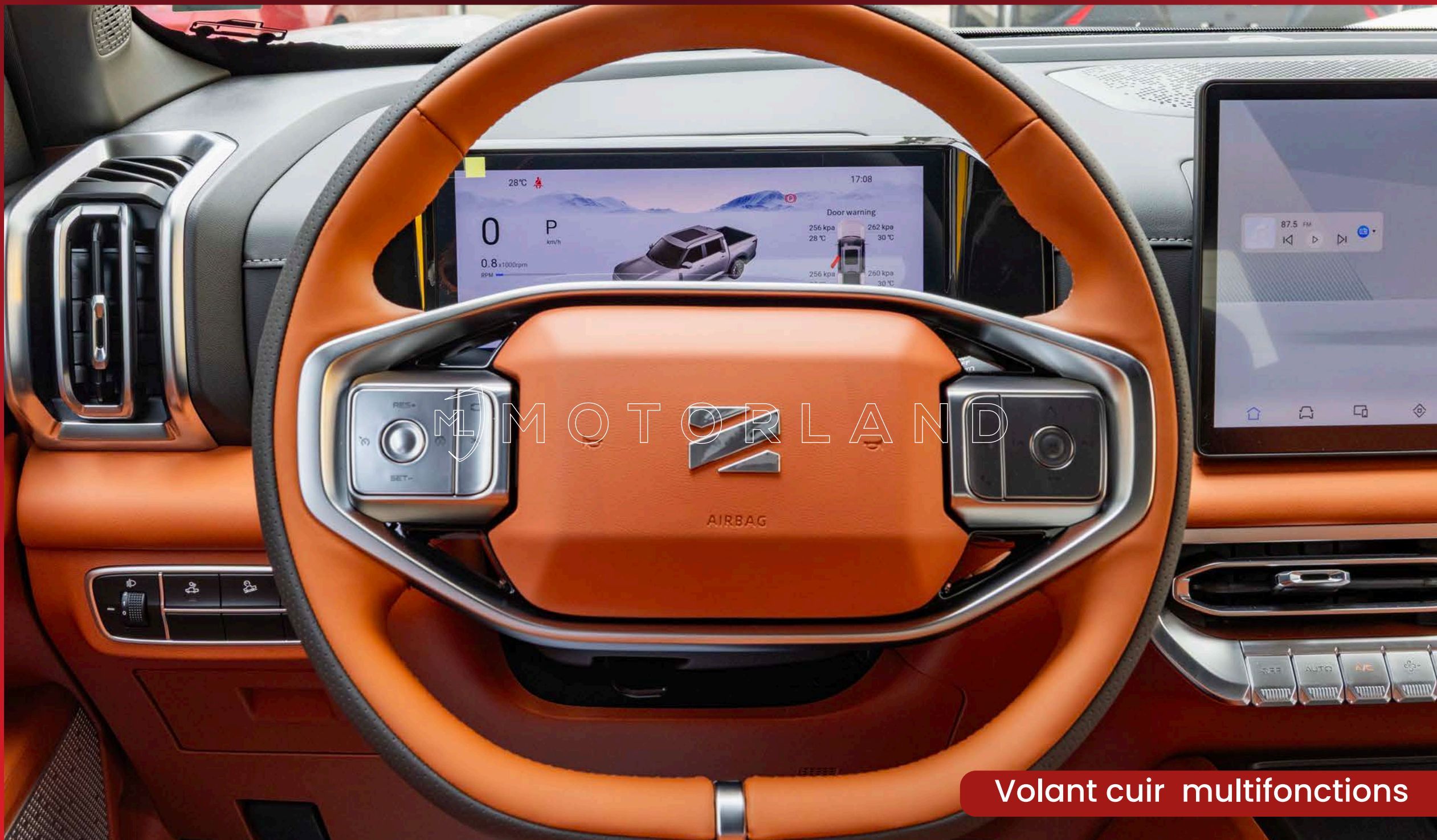
Volant cuir multifonctions