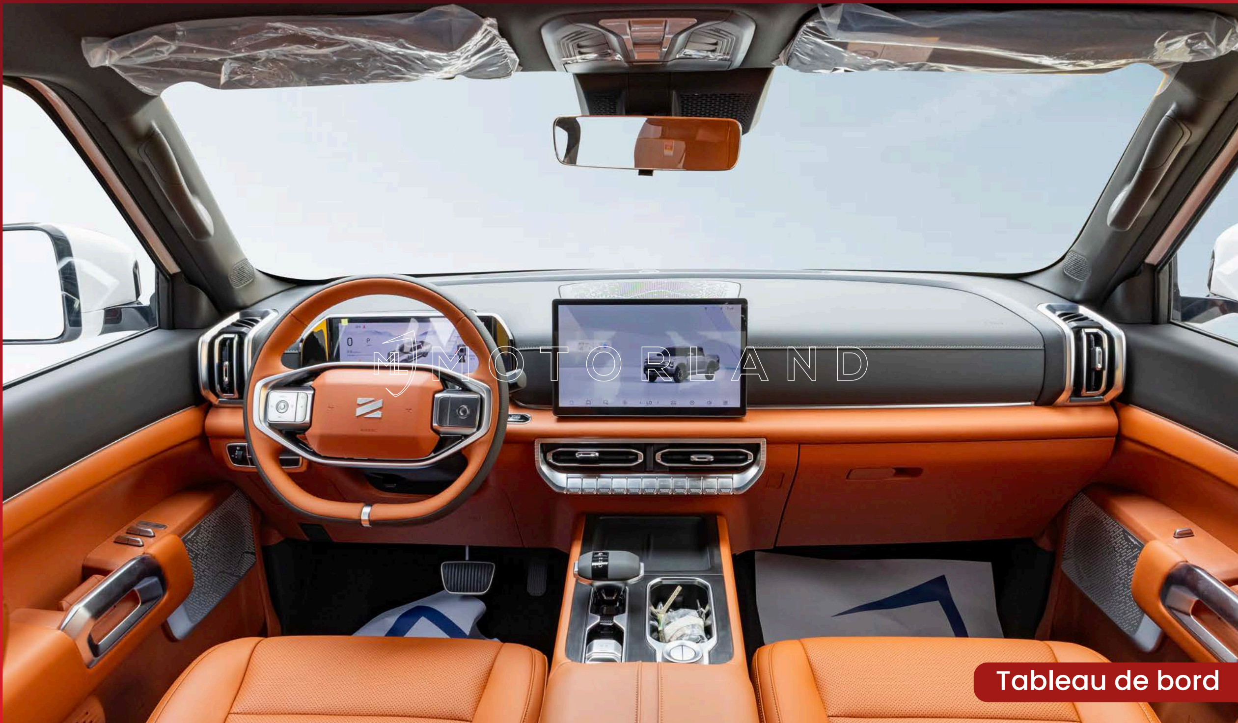
Tableau de bord