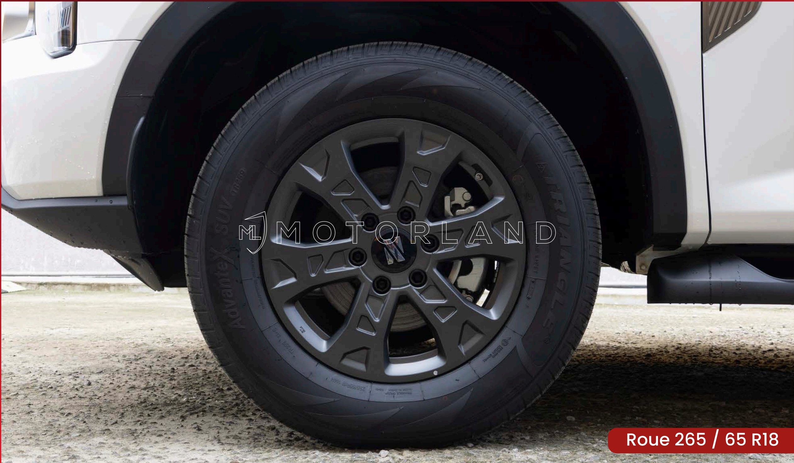
Roue 265 / 65 R18