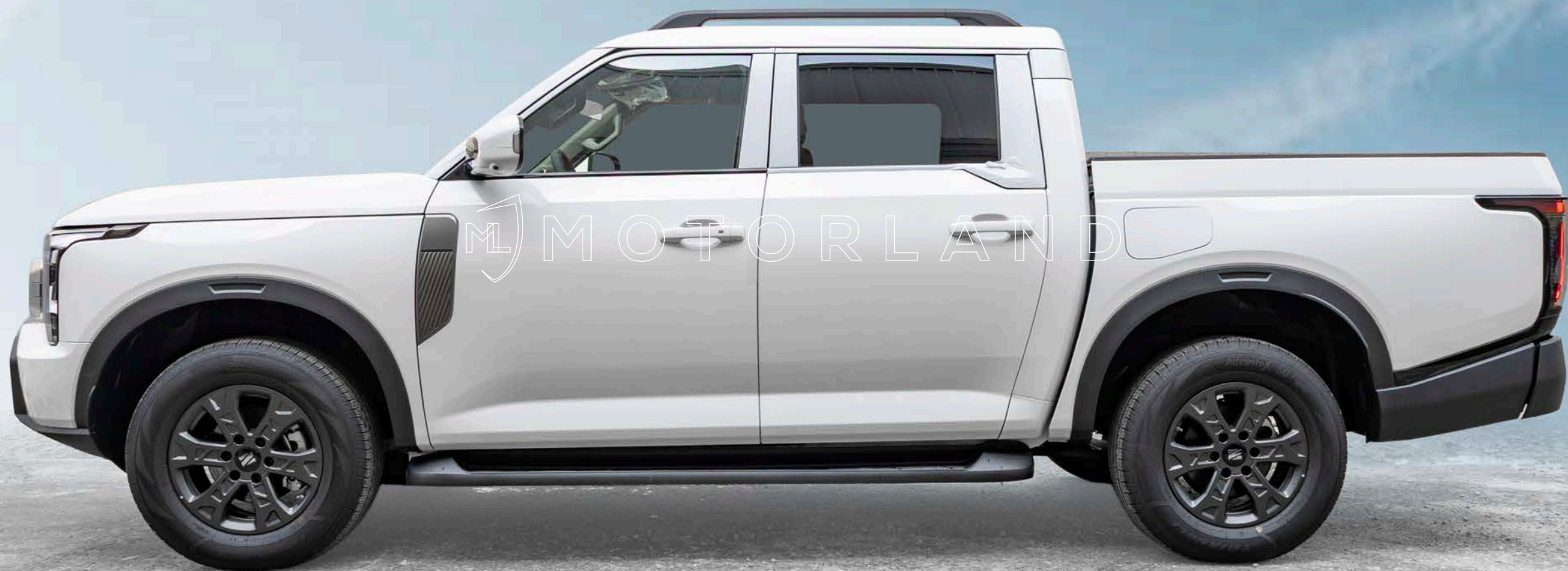
Vue de profil