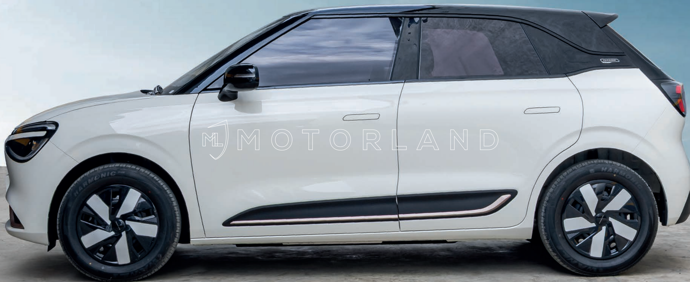
Vue de profil