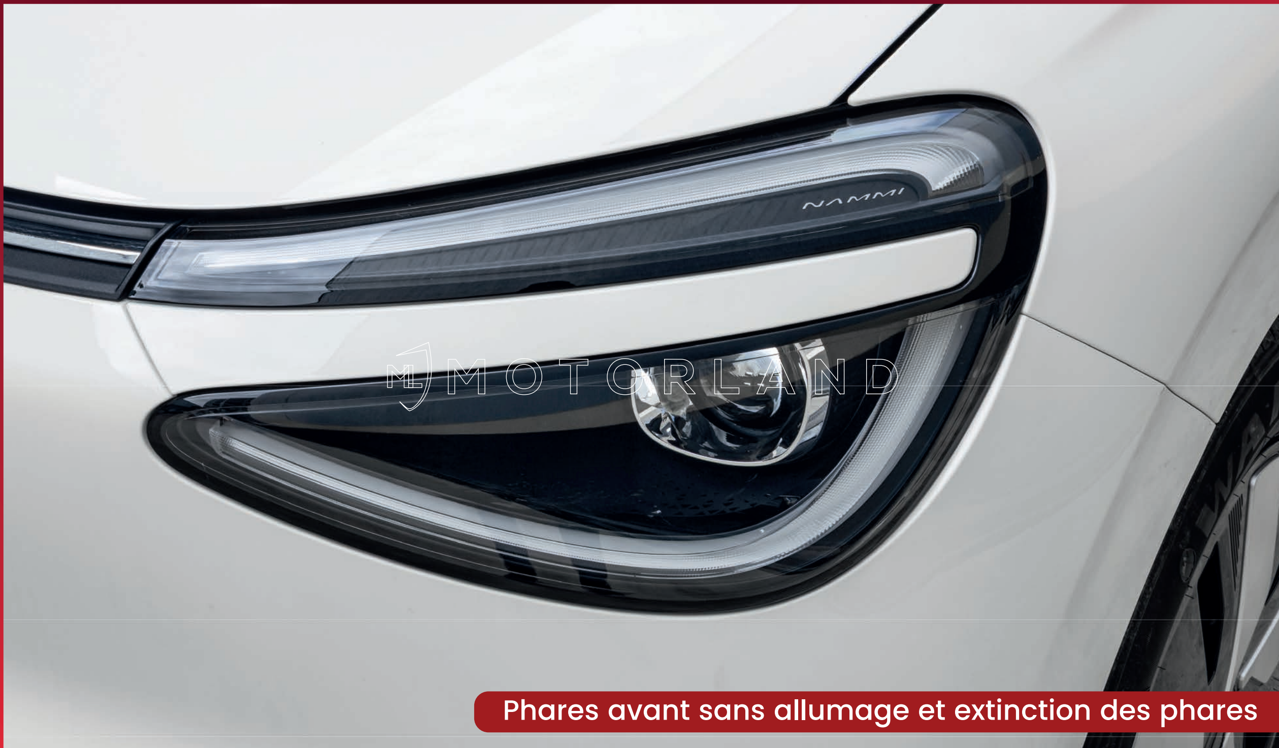
Phares avant sans allumage et extinction des phares