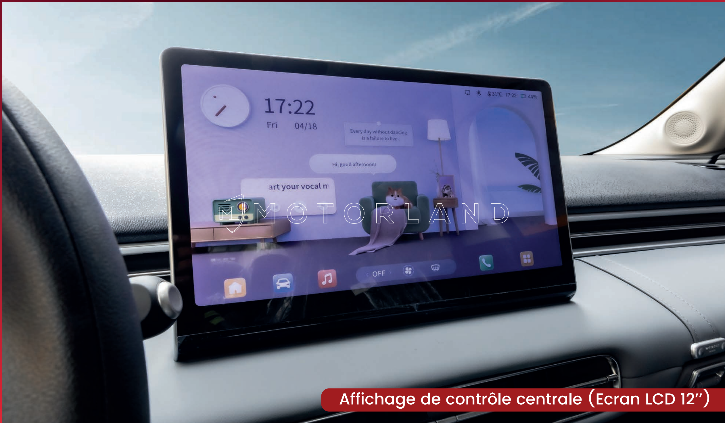
Affichage de contrôle centrale (Ecran LCD 12")