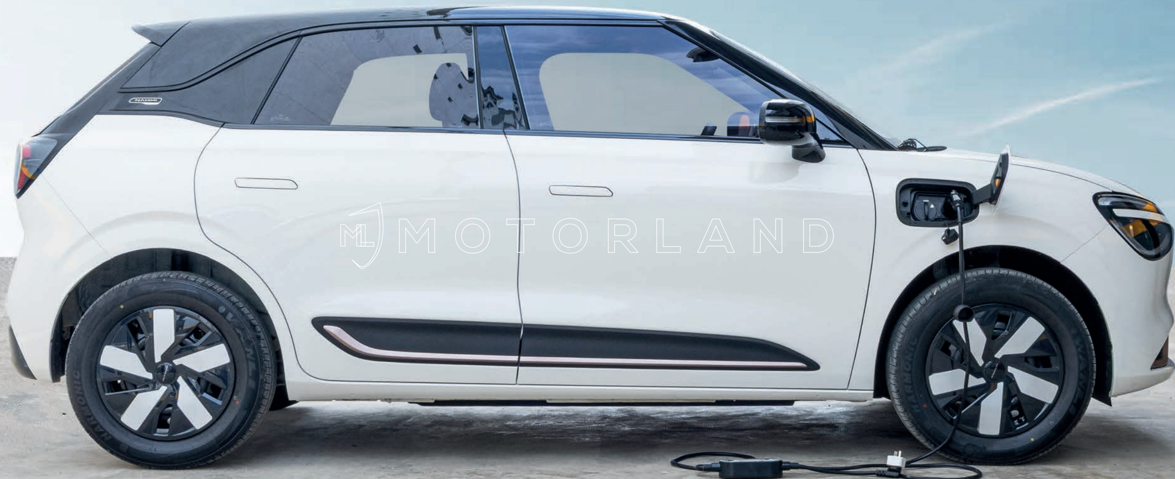
Vue de profil