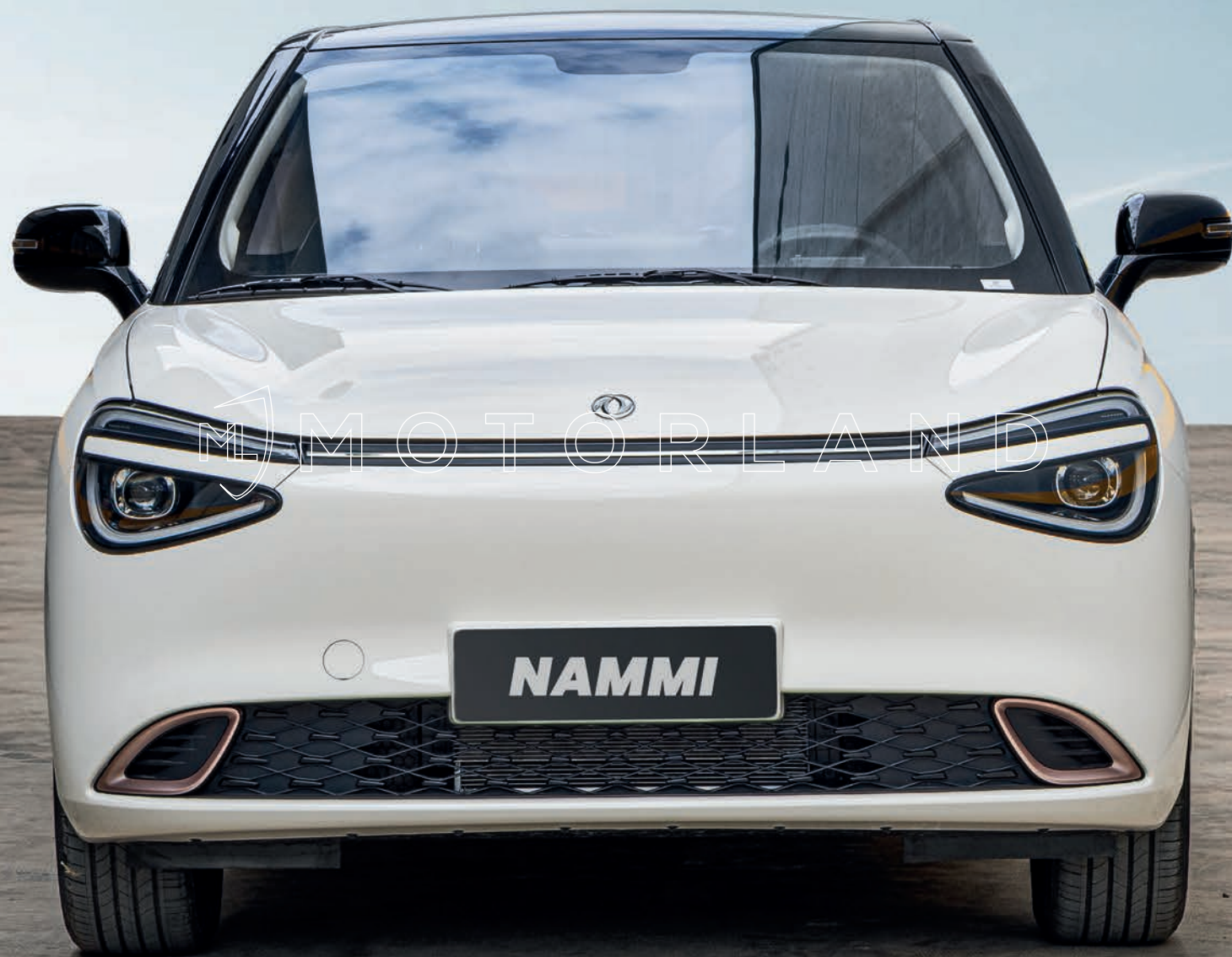
Vue de face