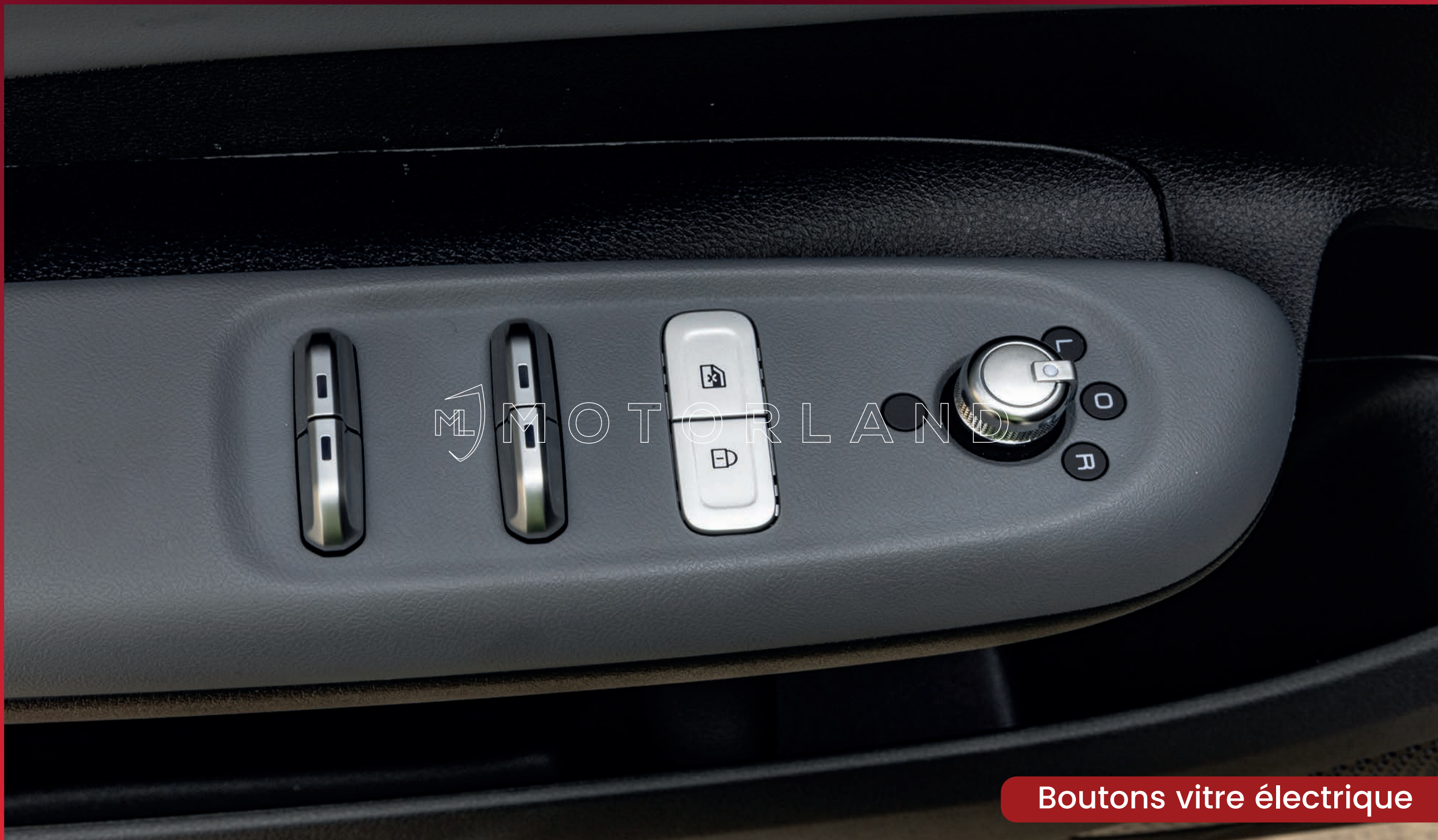
Boutons vitre électrique