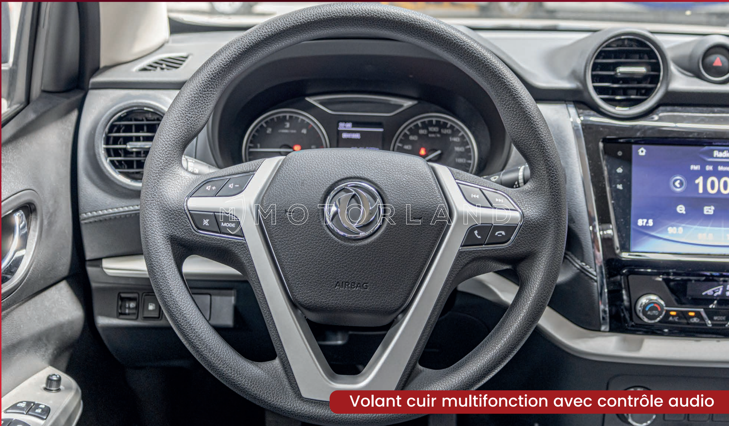
Volant cuir multifonction avec contrôle audio